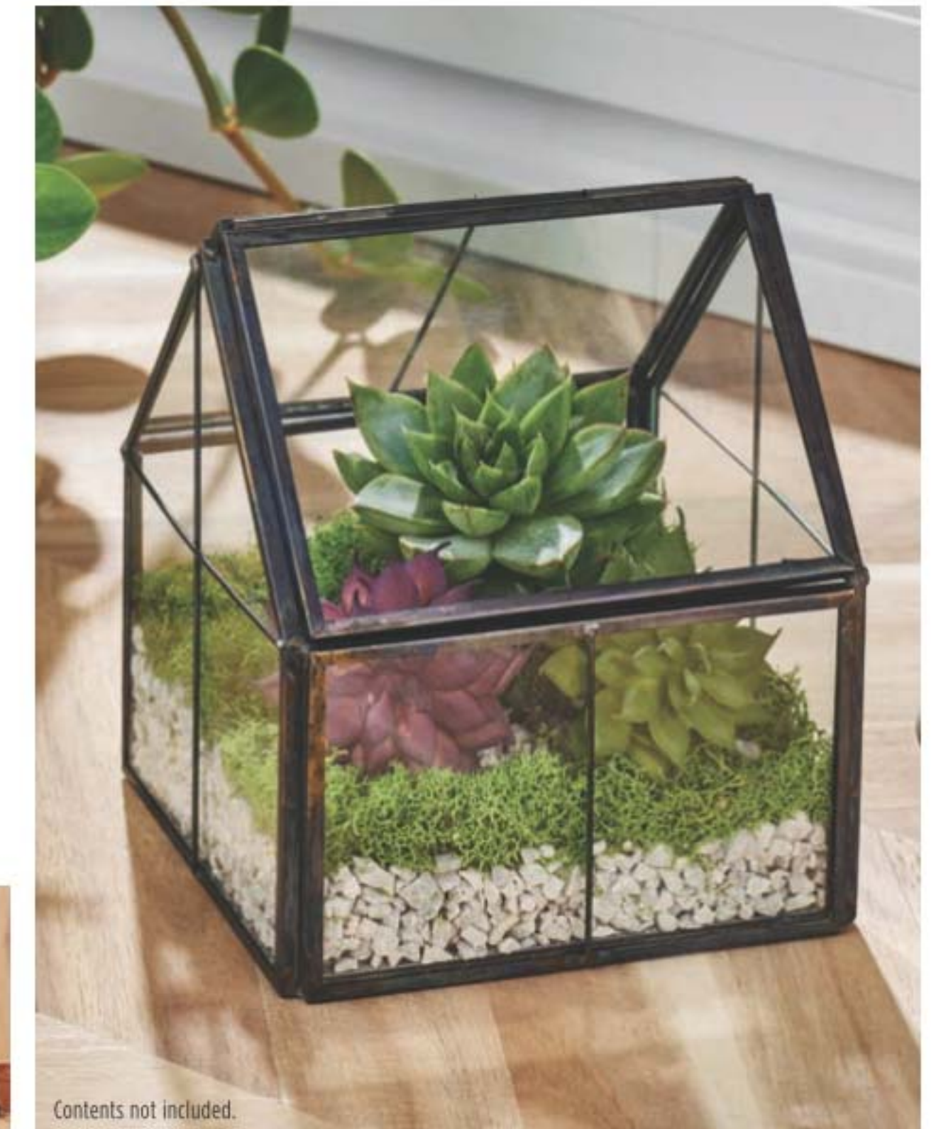
Contents not included.