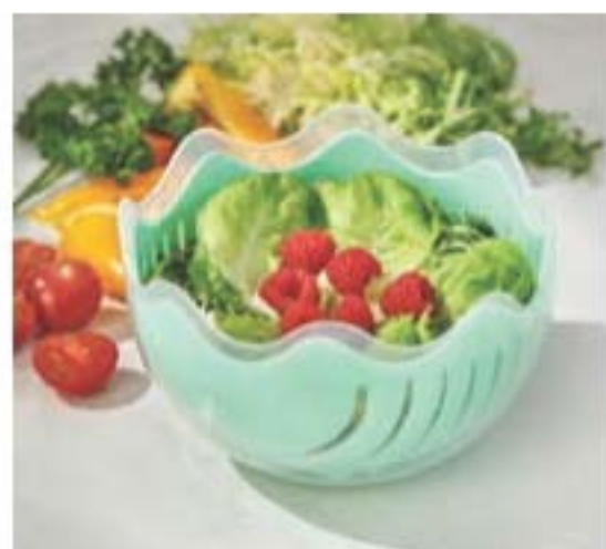
3. Solid bowl to mix fruits and vegetables and toss salads.