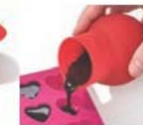
Baking mold not included.