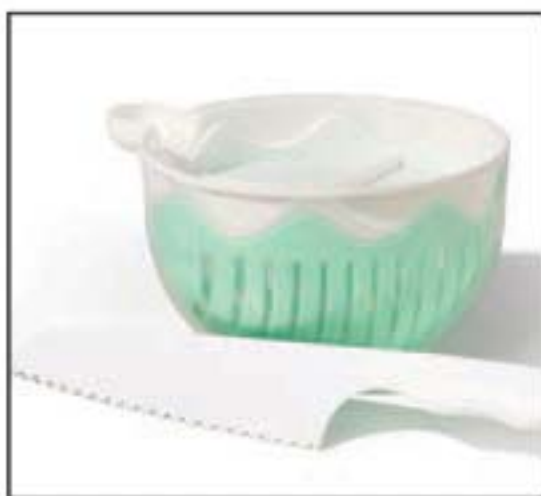
2. Knife to cut fruits and lettuce.