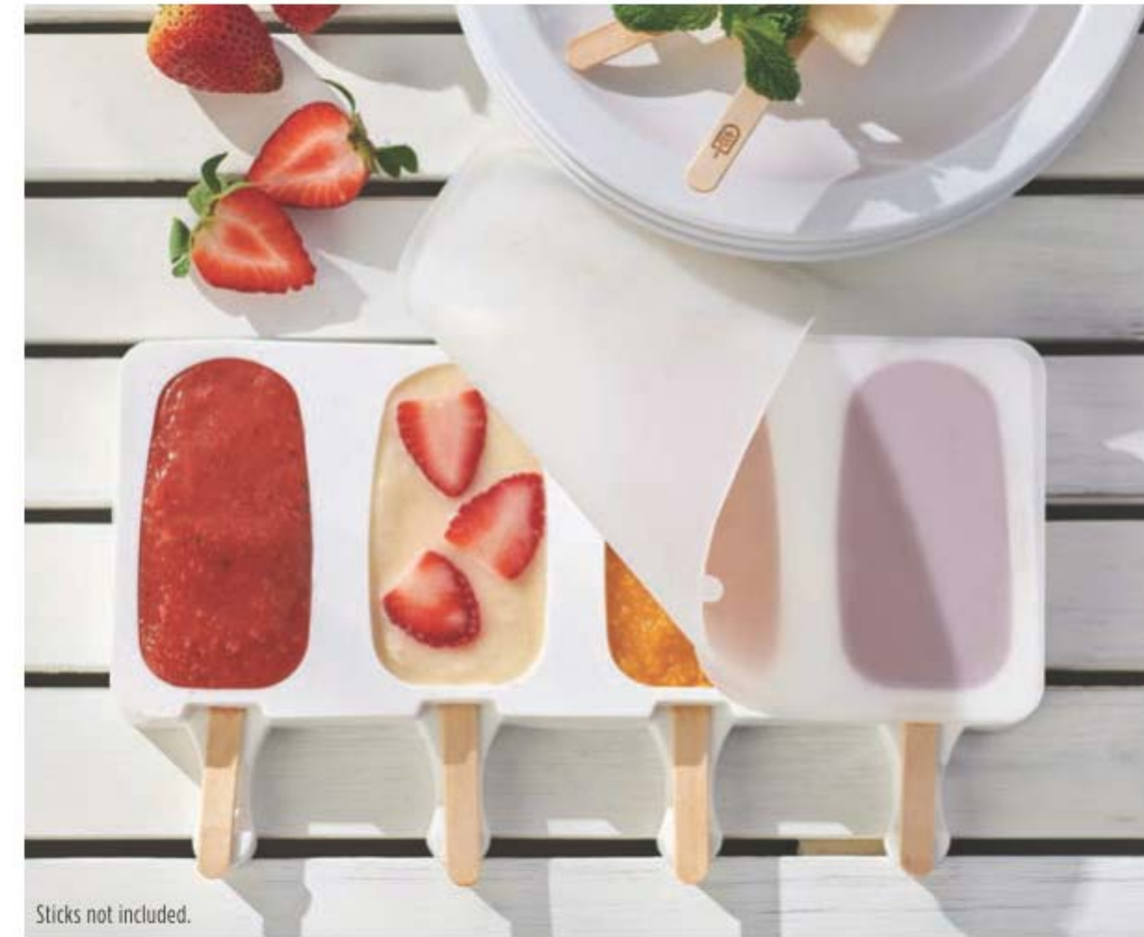
Sticks not included.

From cost-saving ice pops at home to earth-saving reusable bags and containers, keep your sugar and spice perfectly nice!