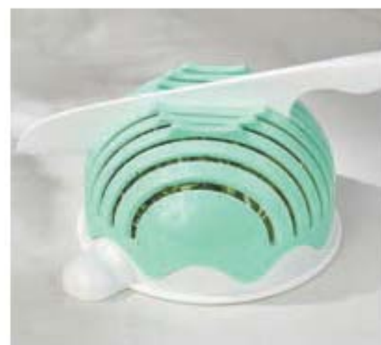
1. Slotted bowl strains and holds lettuce in place while cutting.