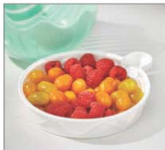
4. Lid holds and stores freshly prepped fruits and veggies.