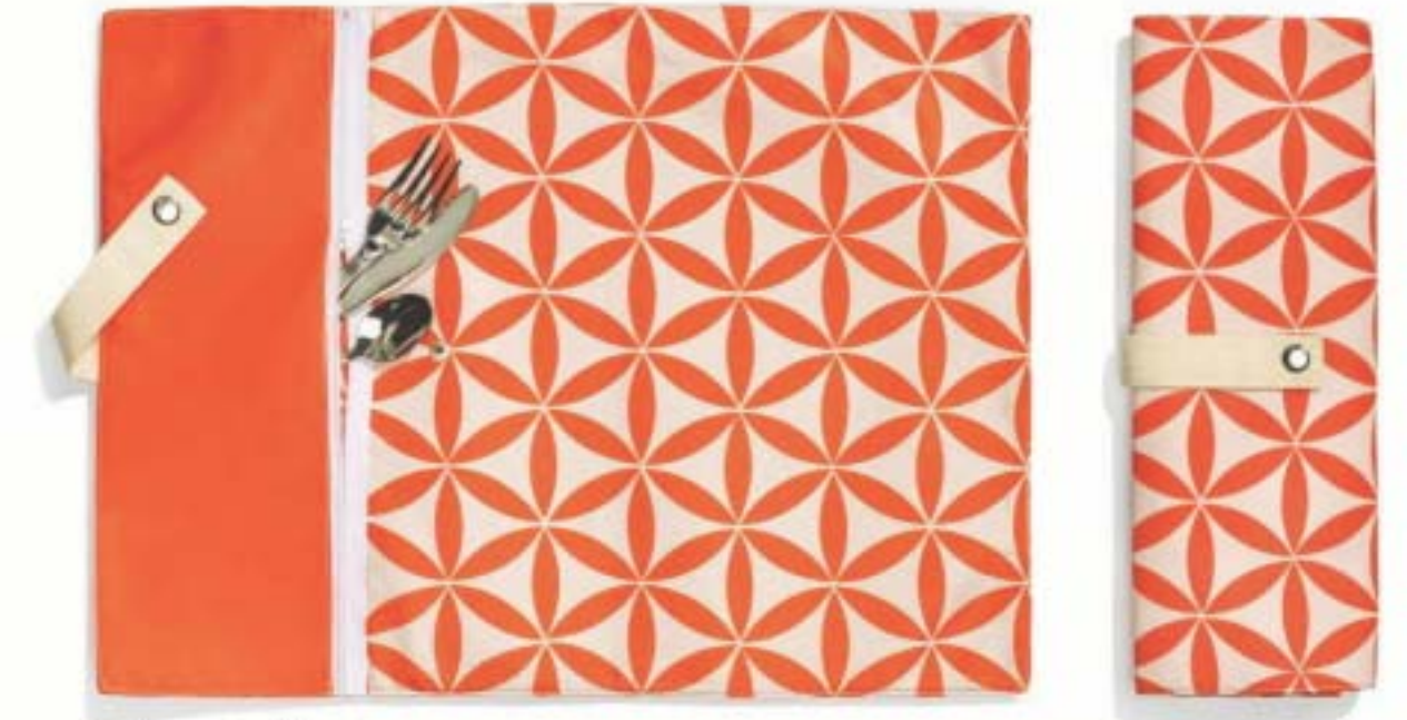
Cutlery not included.

❖ Roll-Up Placemat Holds cutlery, napkins, straws, etc. Easily rolls up and snaps closed. Hand wash. 9" L x 14" W. Polyester. Imported. 031-381 reg. $22.99 $16.99