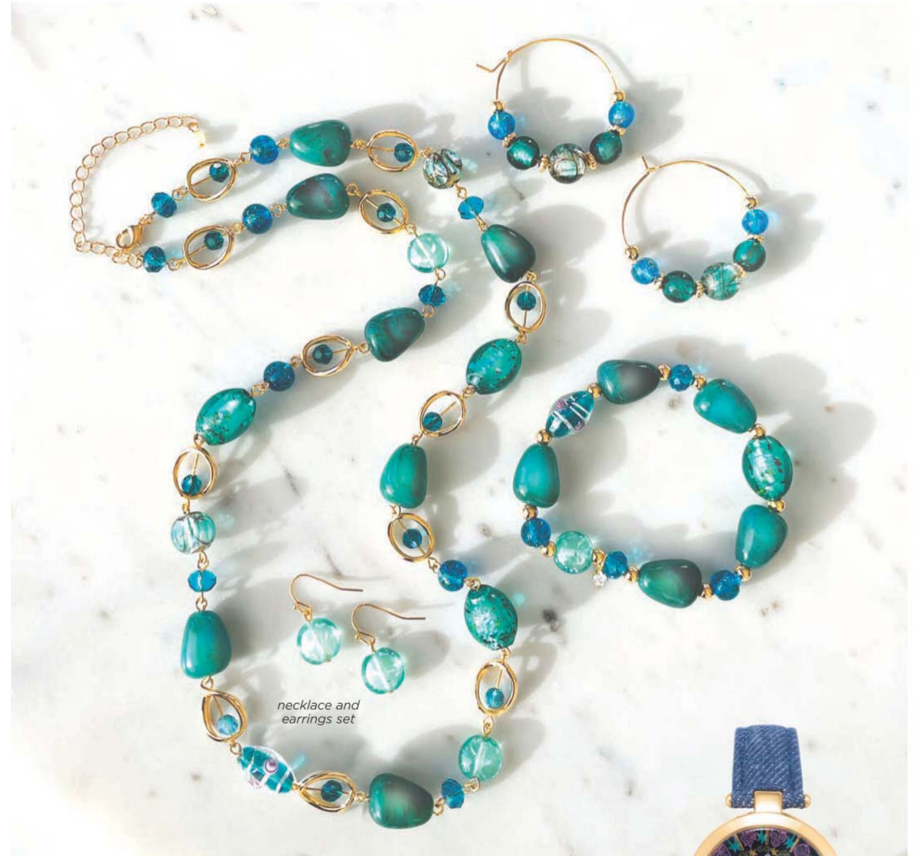
necklace and earrings set