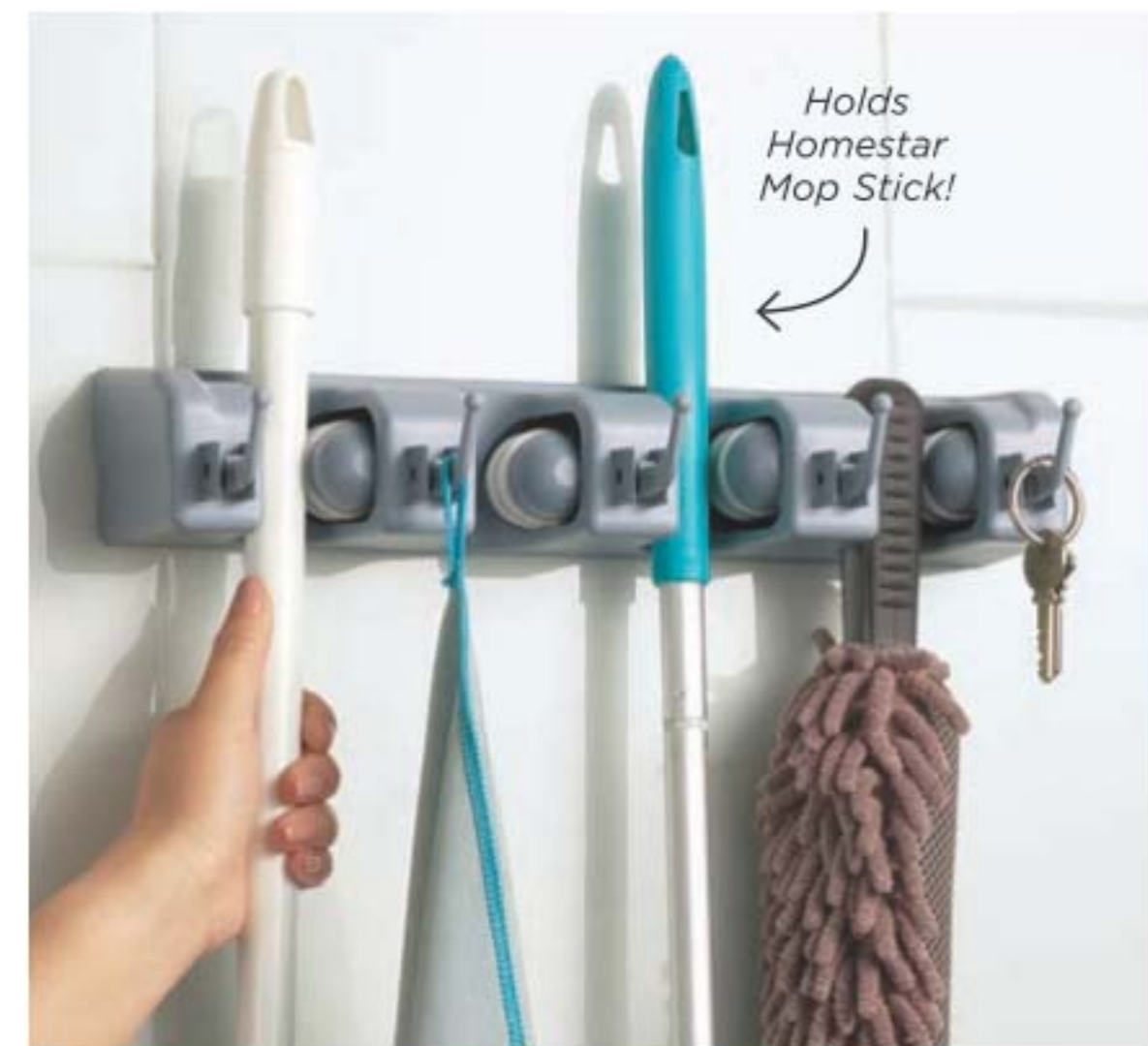
Holds Homestar Mop Stick!