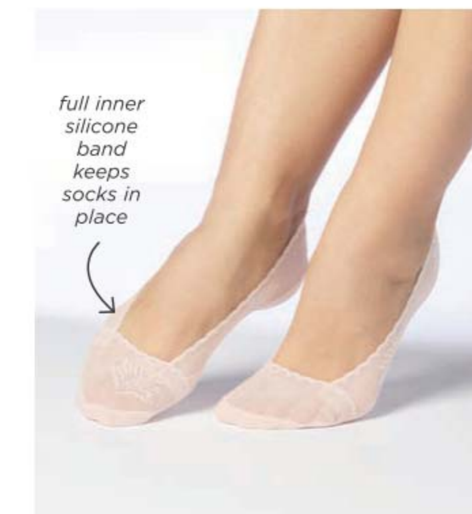
full inner silicone band keeps socks in place

❖ Pedicure Gel Socks Pink pedicure-friendly heel sock lined with moisturizing paraffin-infused gel. Fits shoe sizes 6-10. Cotton/polyester/elastane. Hand wash, line dry. Imported. 025-079 reg. $8.99 $6.99