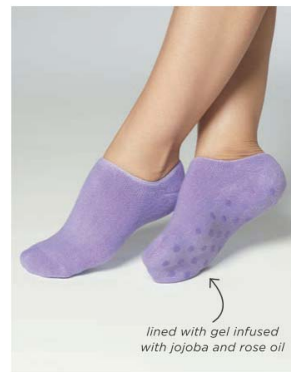
lined with gel infused with jojoba and rose oil

❖ Cooling Sock with Gel Purple sock lined with a moisturizing gel infused with jojoba and rose oil to help nourish feet. Non-slip dots on outsole. Fits shoe sizes 6-10. Cotton/polyester/spandex. Hand wash, line dry. Imported. 026-682 reg. $19.99 $14.99