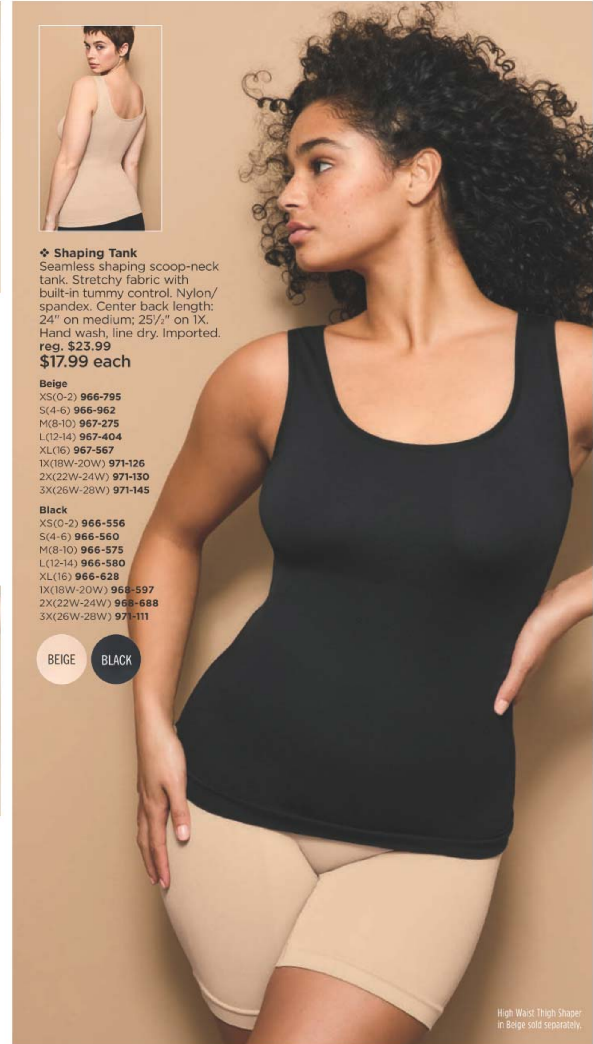
High Waist Thigh Shaper in Beige sold separately.