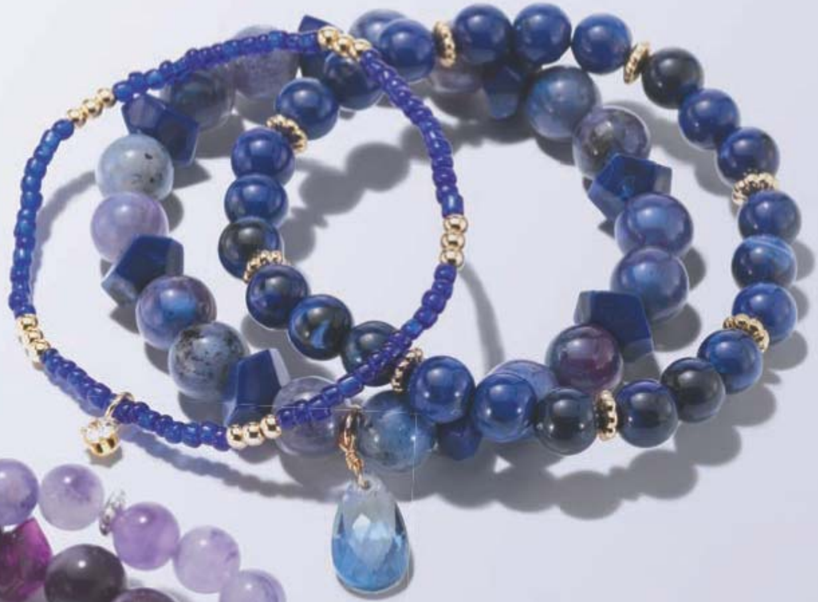
set of 3 bracelets

a trio of beaded bracelets to wear alone or together!