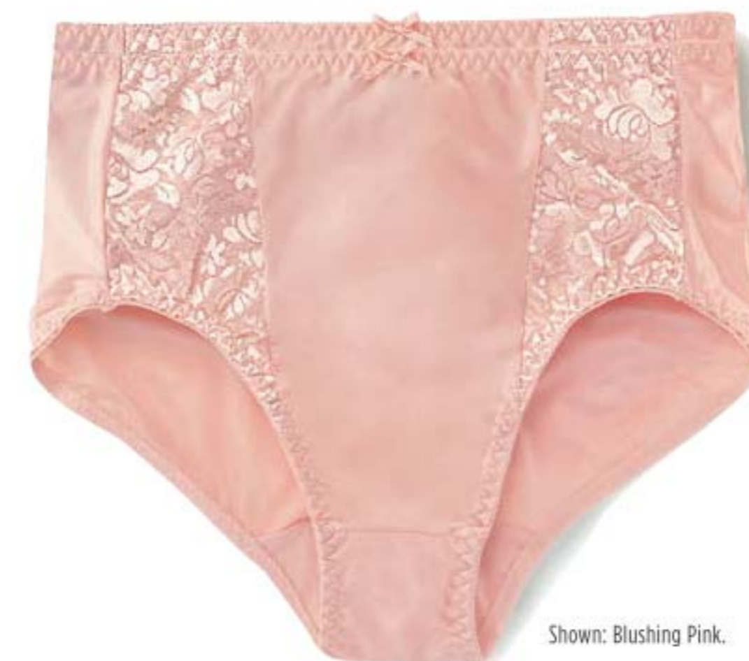
Shown: Blushing Pink.

Back closure. Nylon/polyester/spandex. Hand wash, line dry. Imported. Black: 36-40B; 34-42C,D,DD. Soft Taupe or White: 36-40B; 34-42C,D,DD; 36-42DDD. reg. $48 $38.99