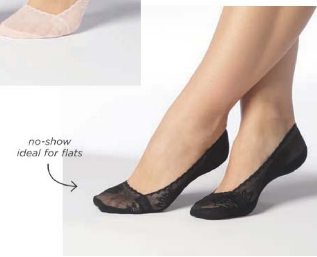
no-show ideal for flats

❖ Lace No-Show Foot Covers No-show socks with lace detail, ideal for flats. Fits shoe sizes 6-10. Nylon/spandex/cotton. Hand wash, lay flat to dry. Imported. Blush 026-792 Black 026-697 reg. $7.99 $5.99 each pair