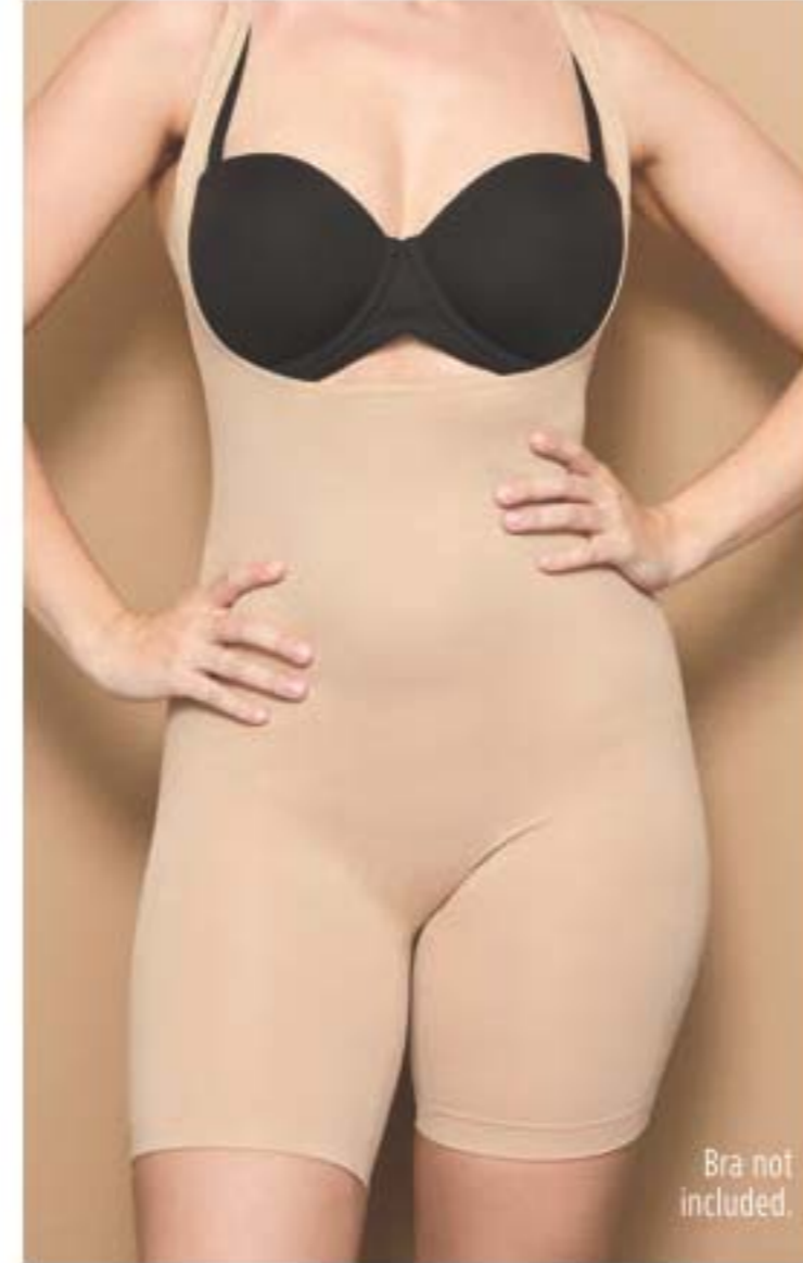
Bra not included.