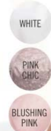
Shown: Pink Chic