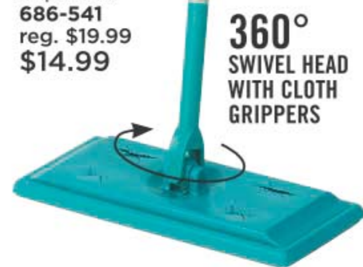
360° SWIVEL HEAD WITH CLOTH GRIPPERS

❖ Homestar Mop Stick Easy-grip handle. Head size: 9 7/8" L x 3 7/8" W. Handle: 39 1/2" L x 5/8" diam. Plastic/EVA/aluminum. Imported. 686-541 reg. $19.99 $14.99