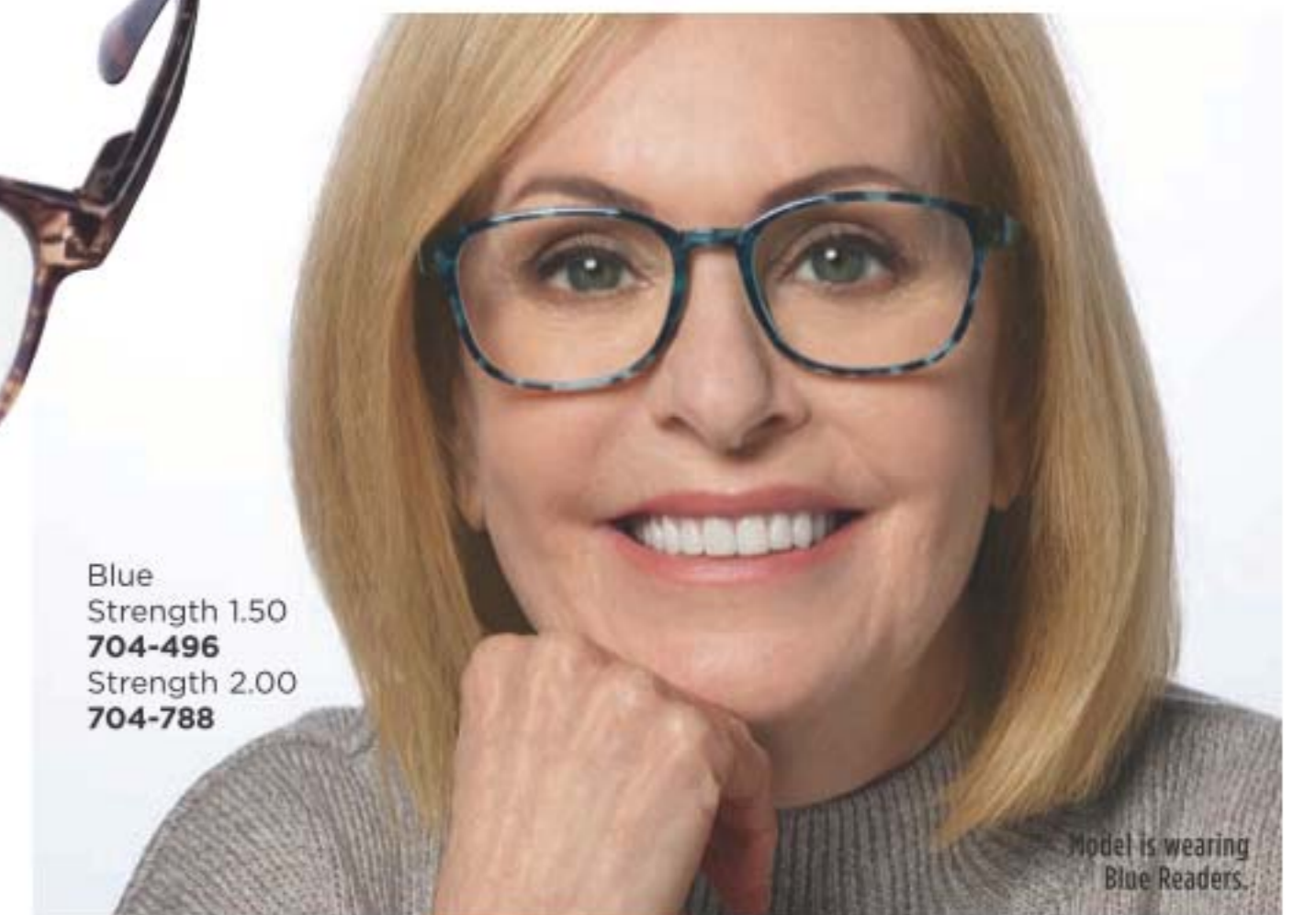
Blue Strength 1.50 704-496 Strength 2.00 704-788