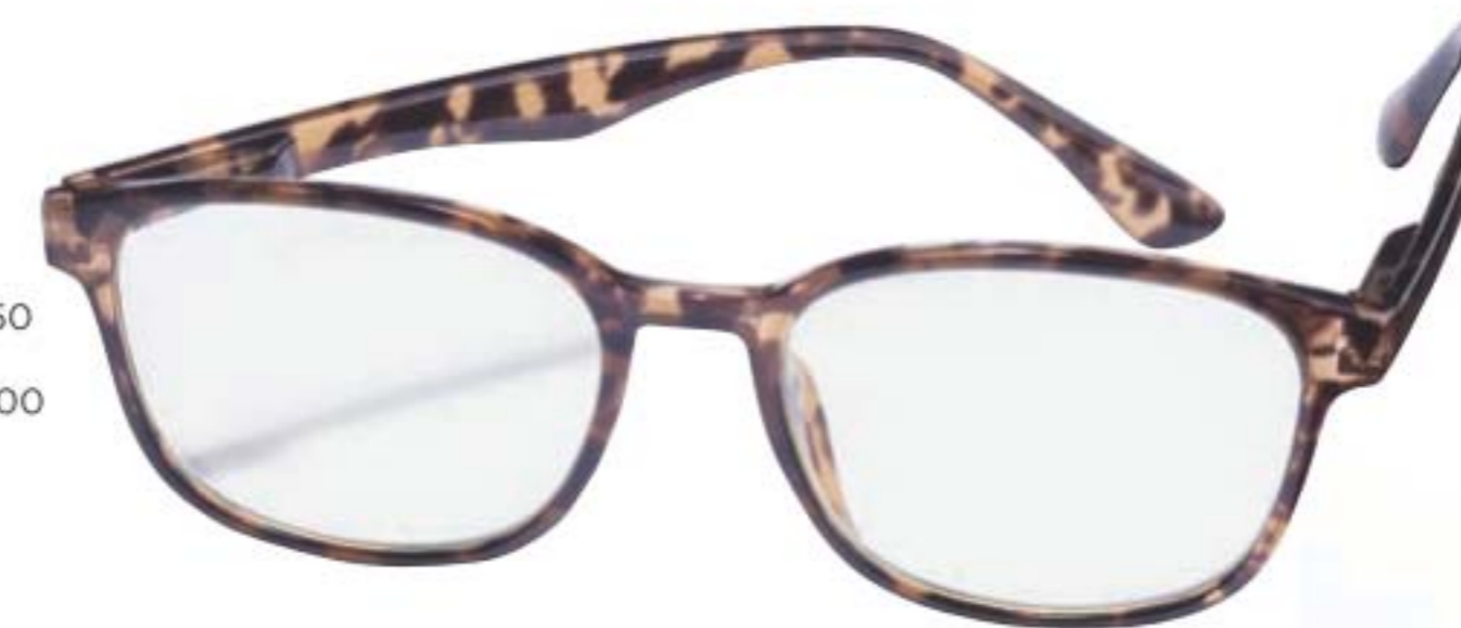
Brown Strength 1.50 704-917 Strength 2.00 704-960